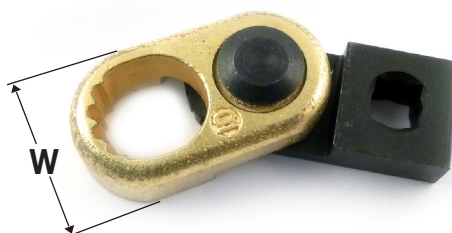
REM 100-8CF Crow-Foot Style