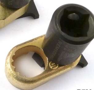
REM 102-56 90° Offset Style