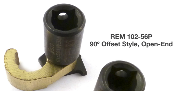
REM 102-56P 90° Offset Style, Open-End