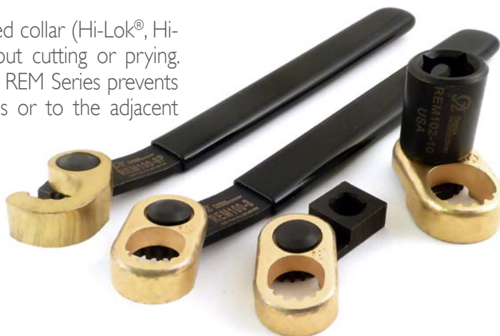
REM100-8P, RE100-8T, REM100-8CF, REM102-10