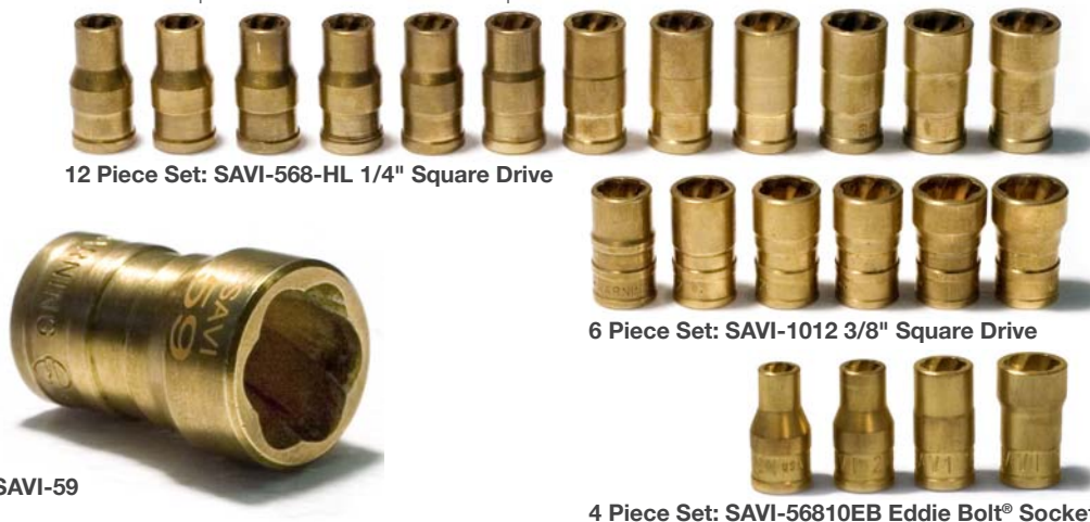
12 Piece Set: SAVI-568-HL 1/4" Square Drive